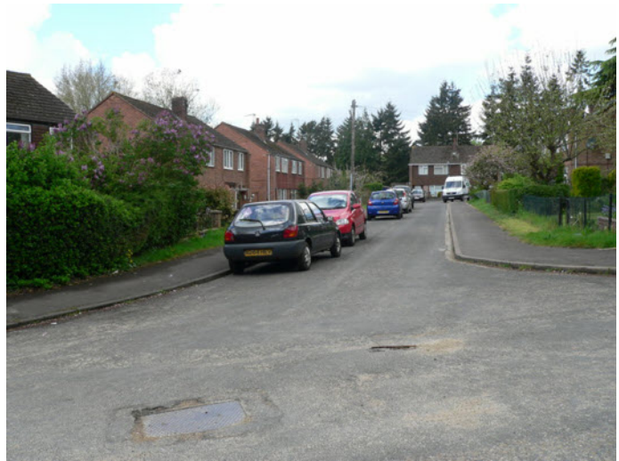
Upper part of Manor Road Estate