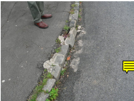
Typical kerb condition.