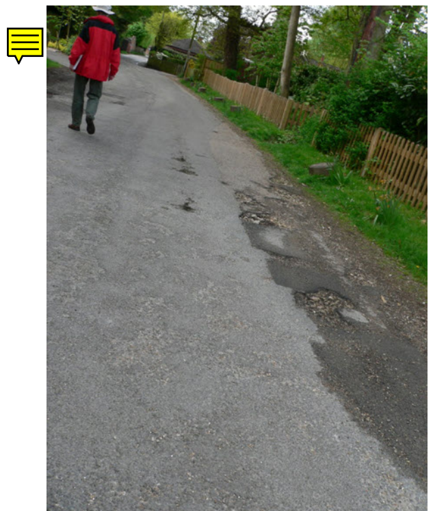
Road surface damage in the region of the new buildings