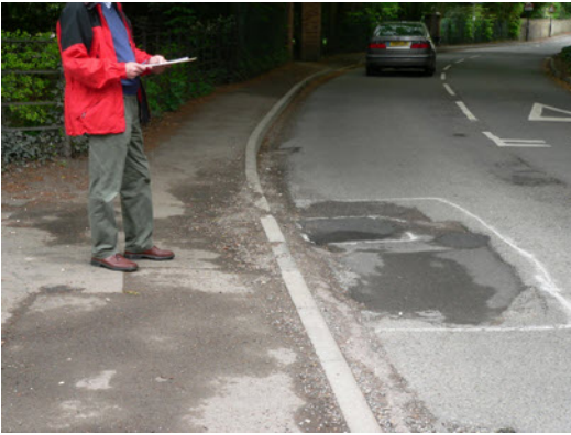
Original hole was repaired badly