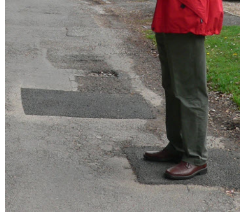
Why leave the middle bit?