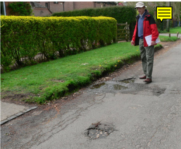
Lots of potholes!