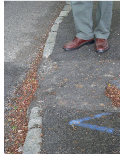
Builders did not replace the sets