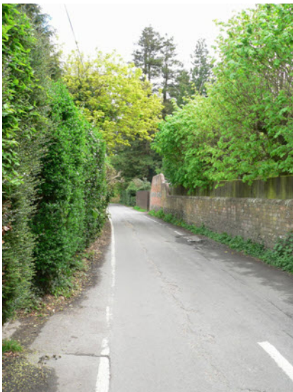
Entrance from the High Street.