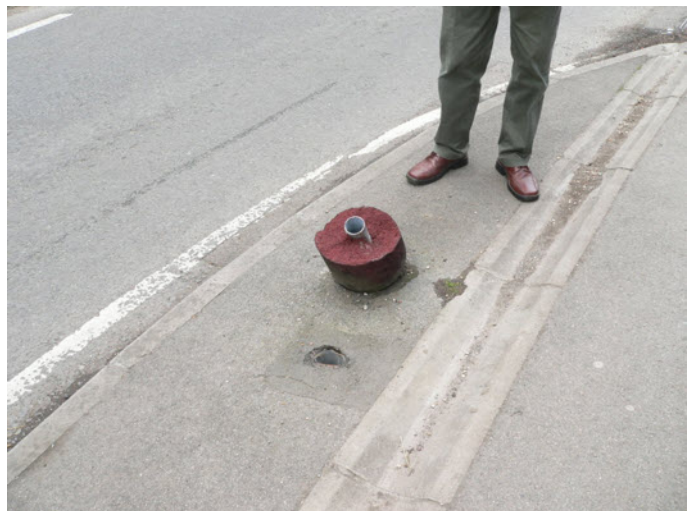
This used to be a bollard.