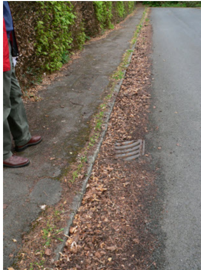
Gutter clogged with leaves