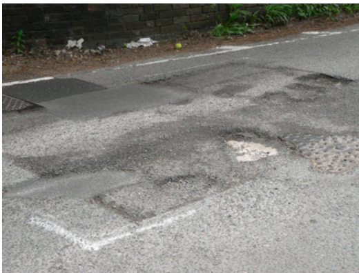
Now look at it!