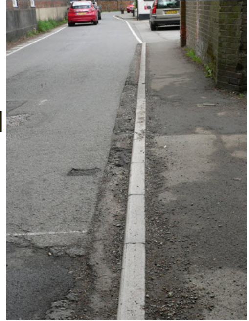
Debris from the potholes