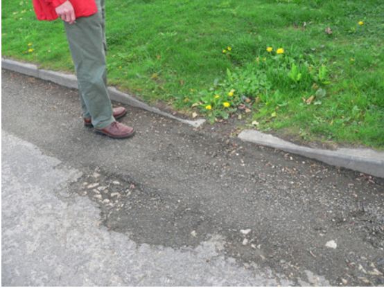
Drainage work needed