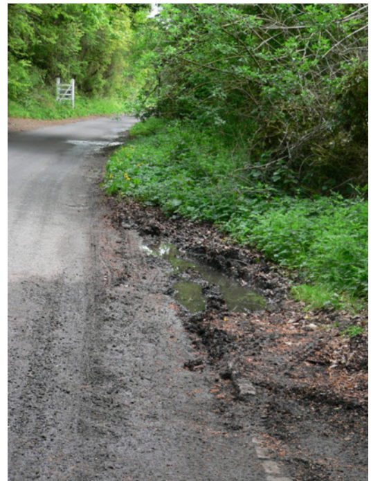
Deep mud hole at the top of Muddy Lane